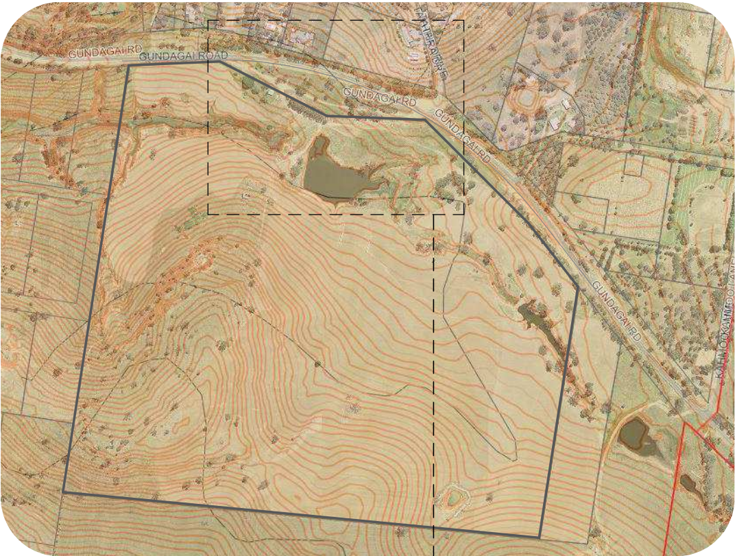
SITE PLAN NTS